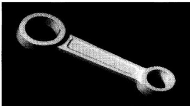
Fig.2. Example of a pre machined discontinuous two-dimensional ceramic-fibre preform ready for infiltration by a molten metal alloy in the manufacture of a composite connecting rod with a net-shaped metal matrix.